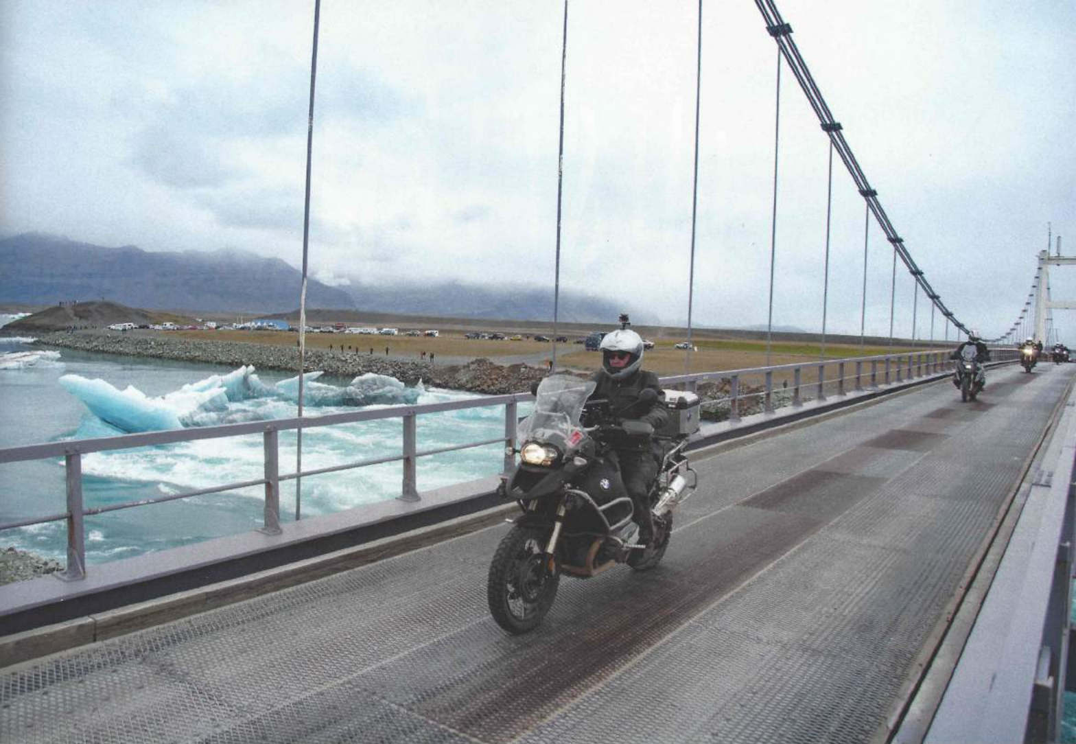
Crossing the Jökulsárlón Glacier Lagoon.

I was a quarter-mile from the road when FU-26 got in her last licks. Over I went in the soft, thick mud. The right sides of the bike and myself were coated in the stuff. I returned to a state of humility and respect for FU-26. I did finally get my long, hot shower, and our rest day in Husavik was most welcomed. I reflected on the challenging (and slightly terrifying at times) day of riding I had survived.