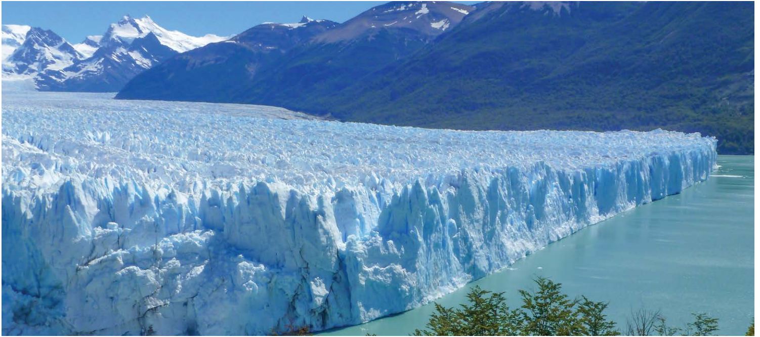
Perito Moreno Glacier, Argentina