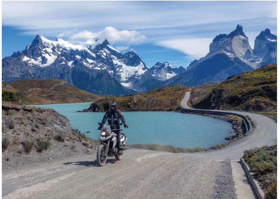
Torres del Paine National Park, Chile

In addition to the standard inclusions on all of our premium tours, the tour price includes Perito Moreno Glacier boat excursion, Straits of Magellan ferry, all breakfasts and 10 dinners.