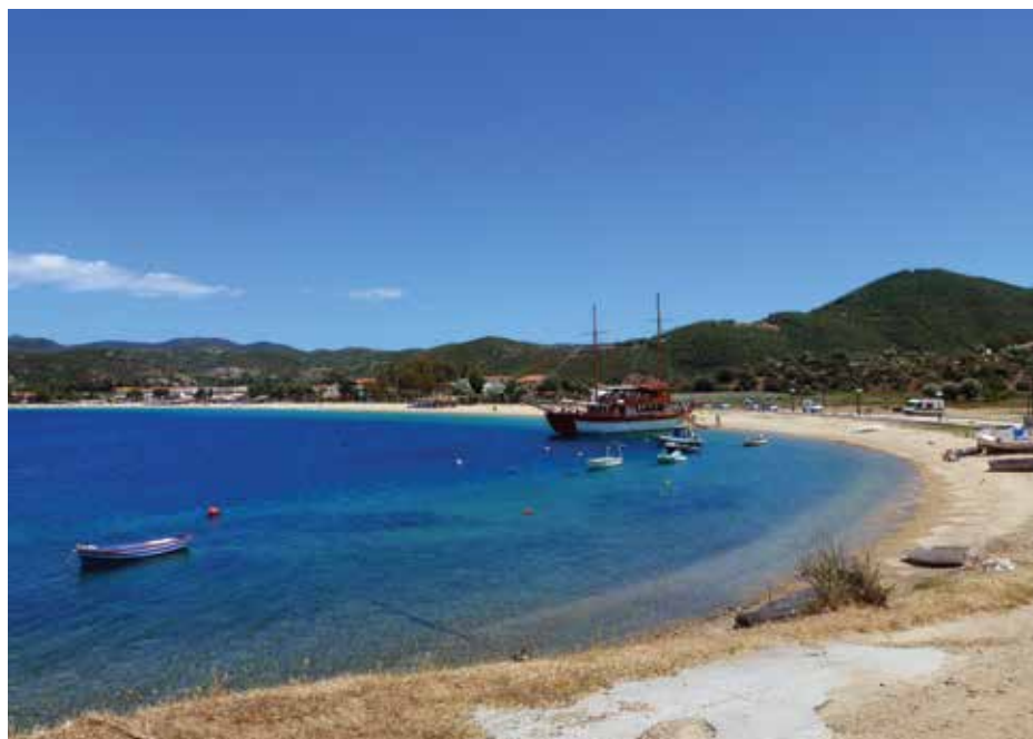
Shore of Sithonia