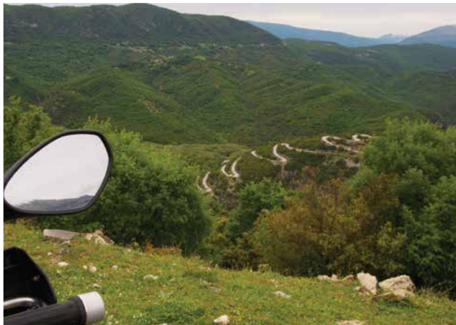
The Pindus Mountain Range