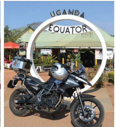
Equator Crossing, Uganda

If you've never been to Africa, Ayres Heart of Africa tour is certainly a trip of a lifetime. A word of caution: You will want to return to Africa again and again, once you've experienced the wonderful people, riding, wildlife and culture. The highlight of the trip was spending time with the Mountain Gorillas in Rwanda. What a privilege to be a few feet from these magnificent animals. Our tour leaders were outstanding with their attention to details, their wealth of knowledge on the history of the areas and current events, and their willingness to go the extra mile. Ayres Adventures will not disappoint with the premium accommodations, food and activities you'll encounter.