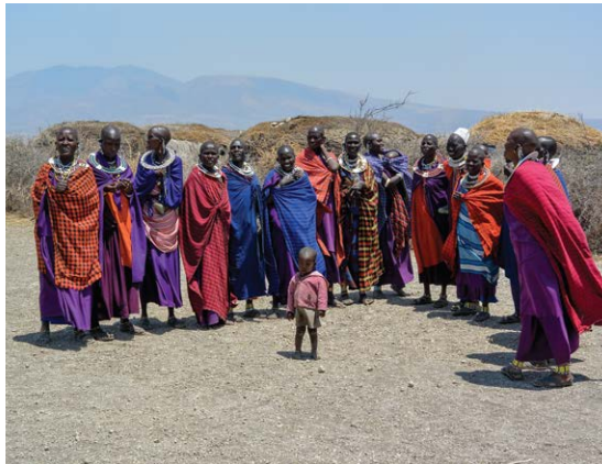
The Maasai Tribe