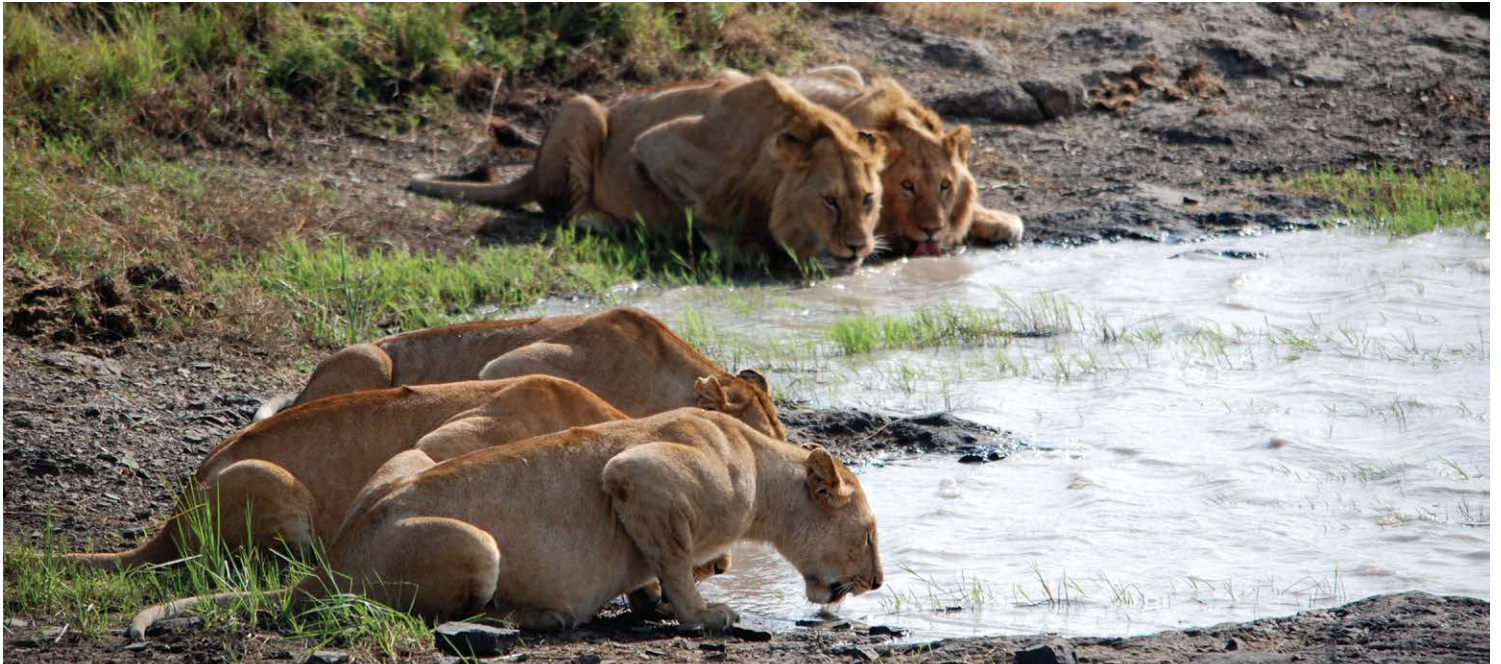
Serengeti National Park, Tanzania