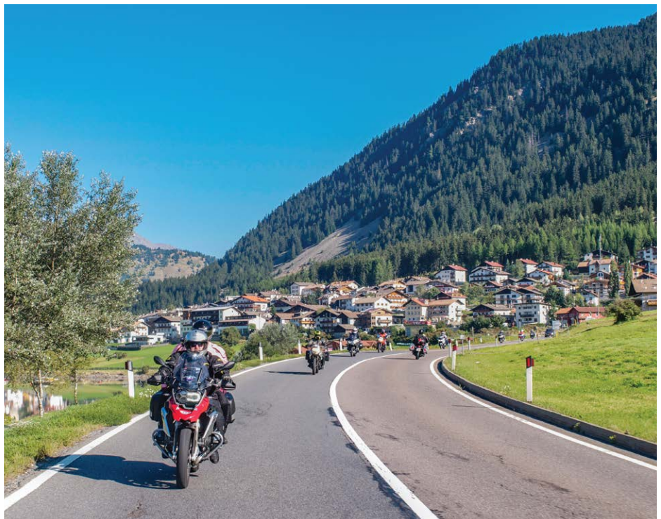
The Dolomites, Italy