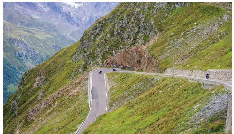
The Stelvio Pass, Italy