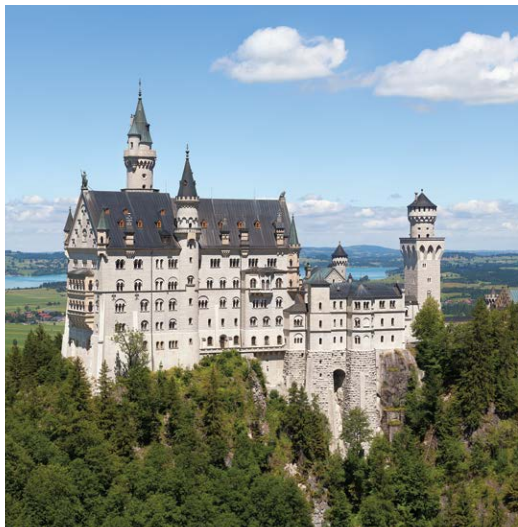
Castle Neuschwanstein, Germany

The route is entirely paved with a variety of road conditions including wonderful sweeping roads as well as some technical riding on twisty mountain roads with several hair-pin turns. This tour is suitable for two-up riding.