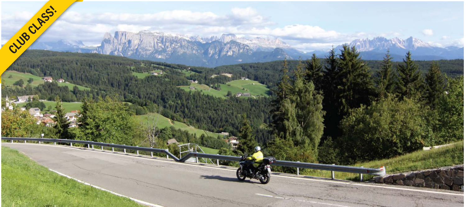
Riding the Alps