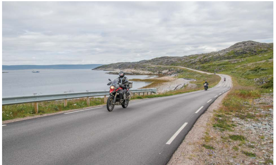
Riding in Norway

The guides were excellent in knowledge of the area and the roads and stops to make. The scenery was awesome beyond words to describe. The best way to see a country is on a motorcycle and a support van to carry your luggage. Ayres is truly a premium tour company that handles all the details so the riders can enjoy the tour. The nightly accommodations were first class and outstanding. I'm looking forward to my next tour with Ayres.