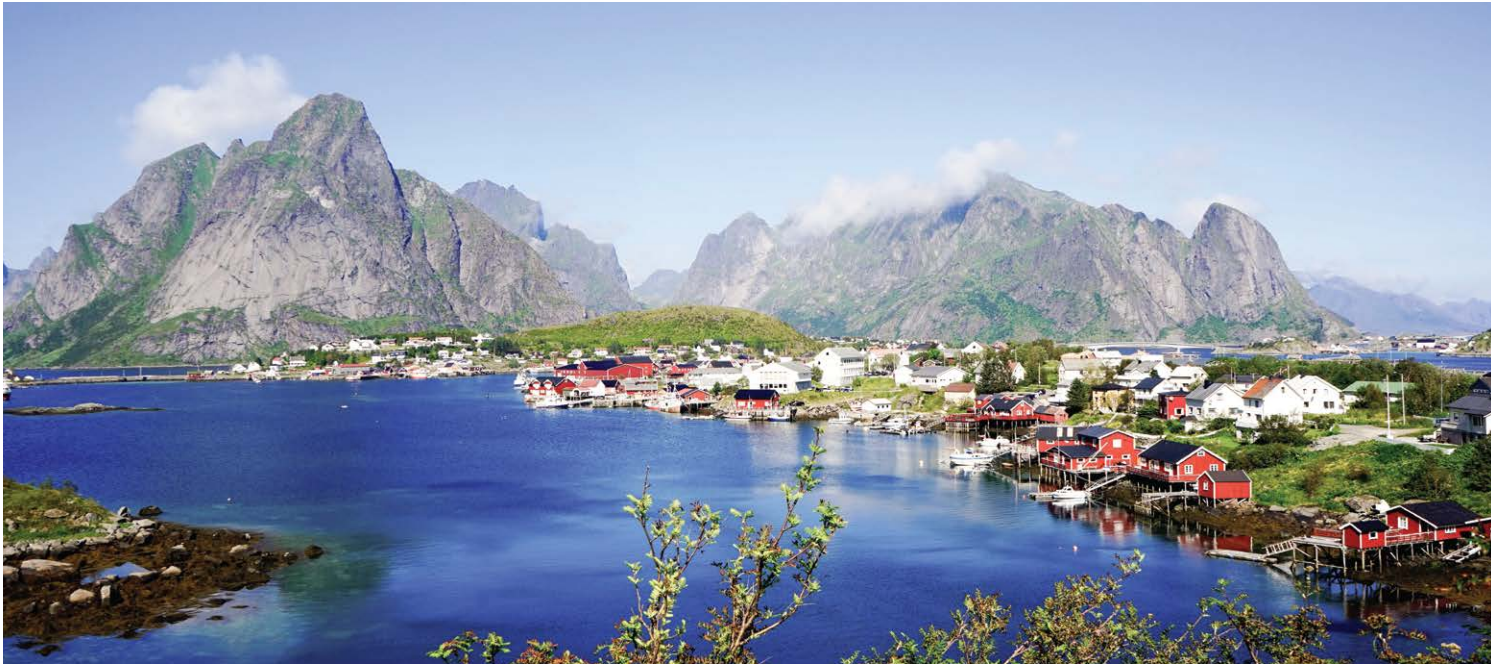
Lofoten Island Village