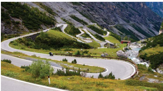
Stelvio Pass, Italy

The route is entirely paved with a variety of road conditions including wonderful sweeping roads and some technical riding on twisty mountain roads with several hair-pin turns. This tour is suitable for two-up riding.