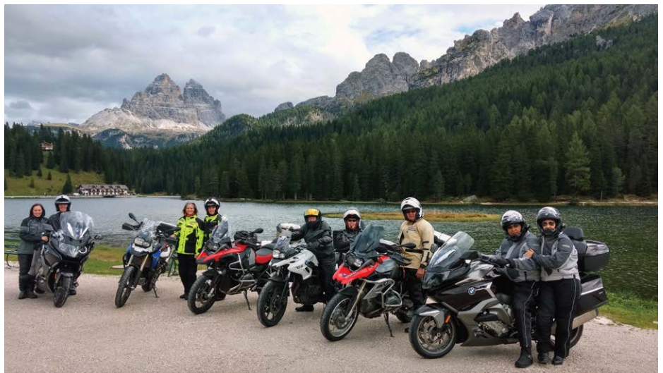
Lake Misurina, Italy