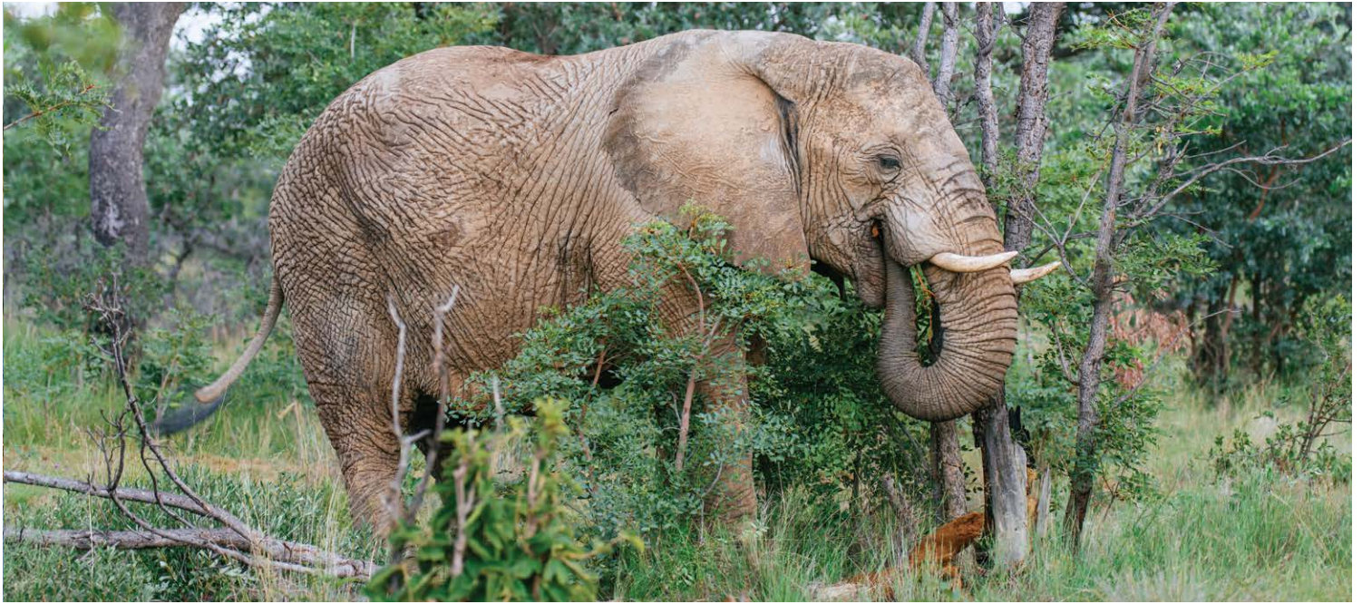
Welgevonden Game Reserve