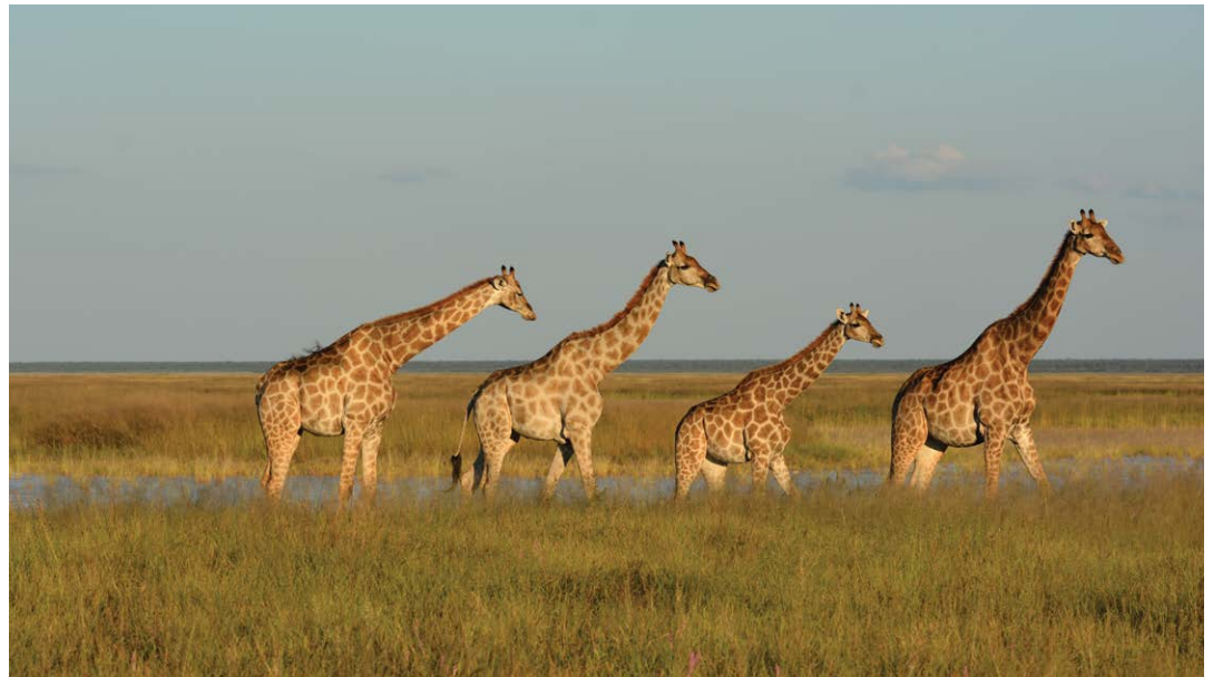
Giraffes in Etosha National Park

Ayres Adventures won us over from our first email exchange! We can't say enough about the quality and professionalism of our Call of the Wild tour...if you experience it (Africa) with Ayres Adventures, you will not be disappointed. From amazing lodges to beautiful landscapes and wildlife, combined with two absolutely incredible guides (Jason and Claus) we could not have been more impressed.