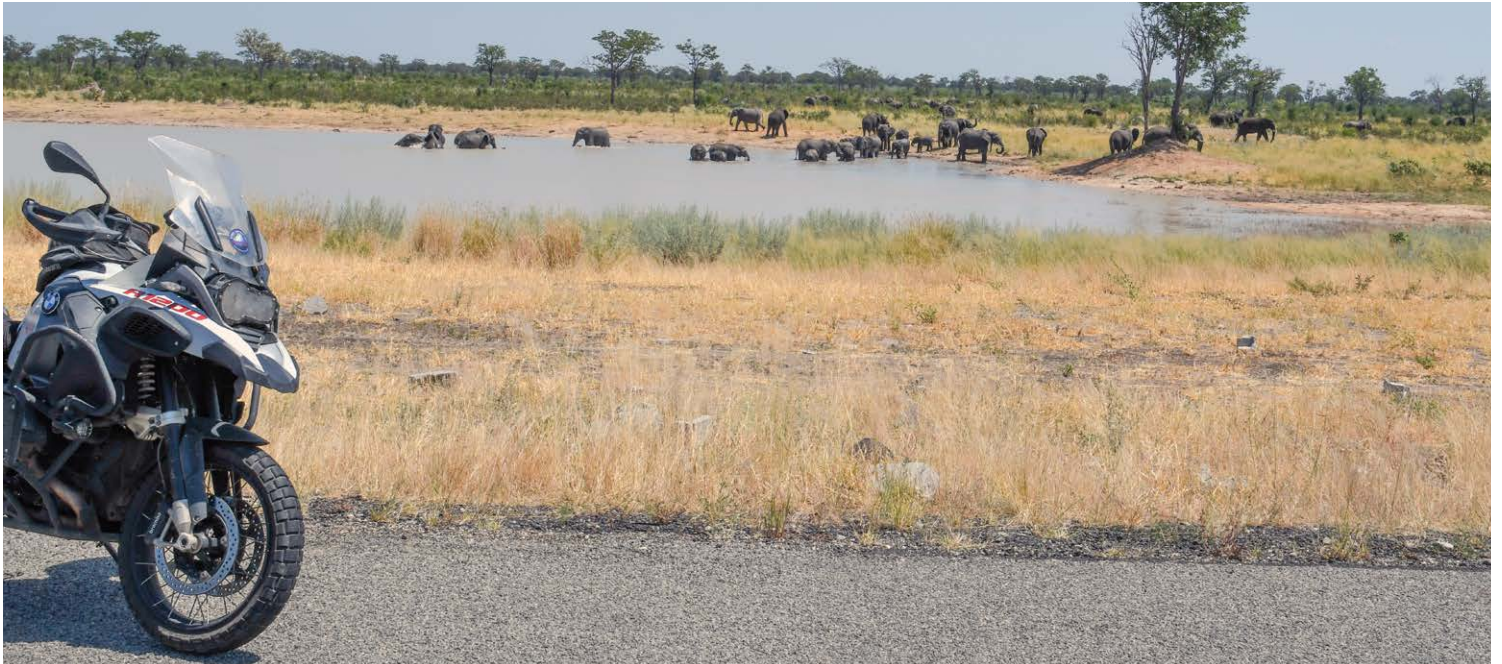
Elephants in Botswana