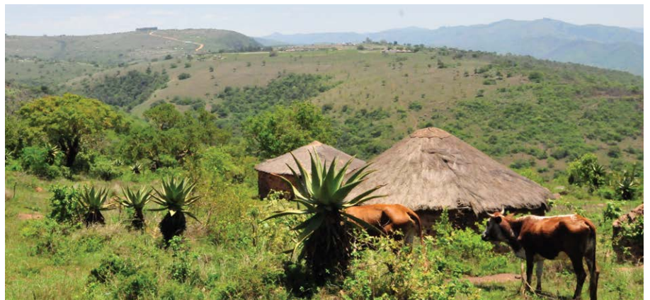
Small Swazi Community