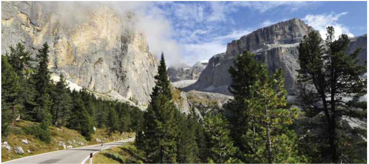
The Great Dolomites Road