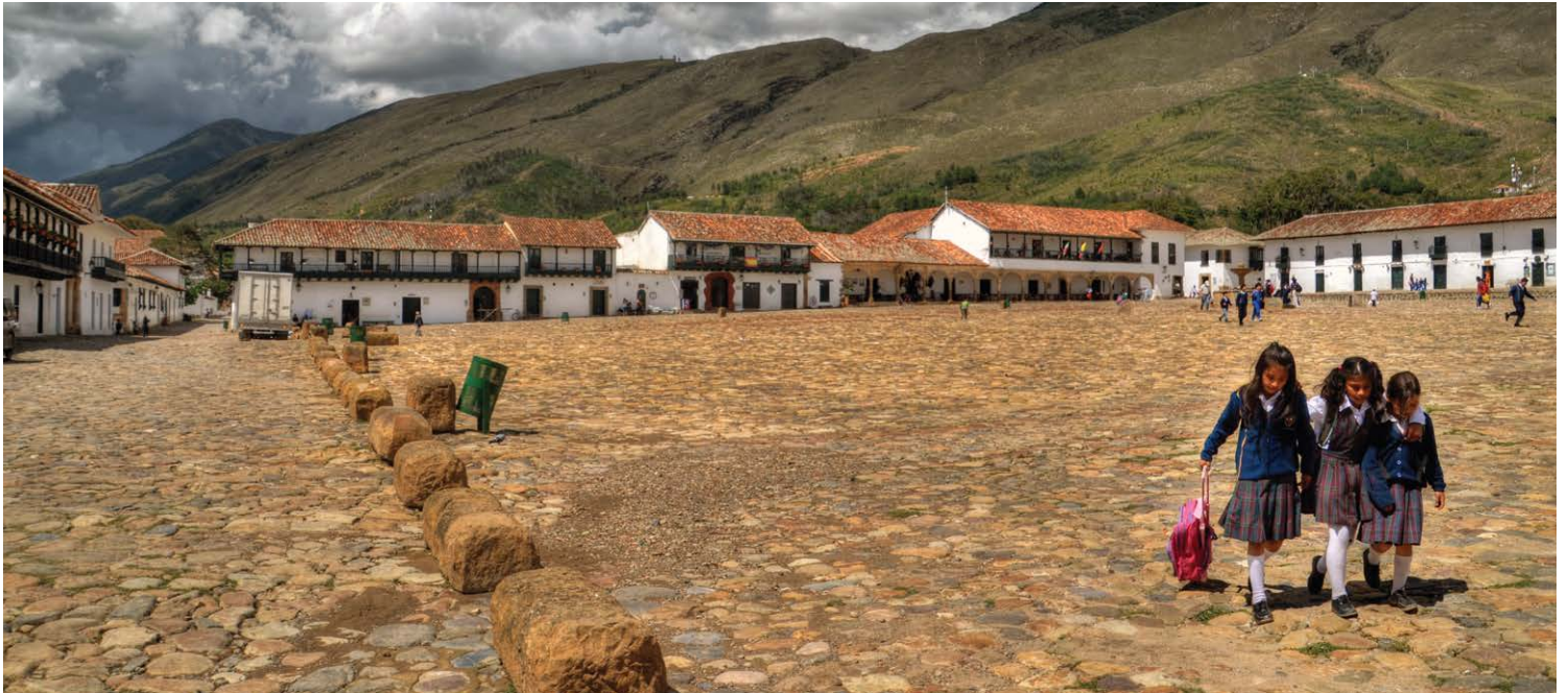
Church of Our Lady of the Rosary, Villa de Leyva, Colombia