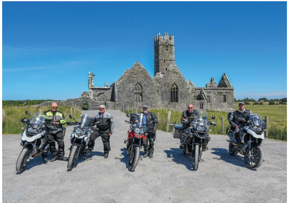
Ross Errilly Friary

In addition to the standard inclusions on all of our premium tours, the tour price includes entry fees to the Cliffs of Moher and Giant's Causeway, all breakfasts and 9 dinners.