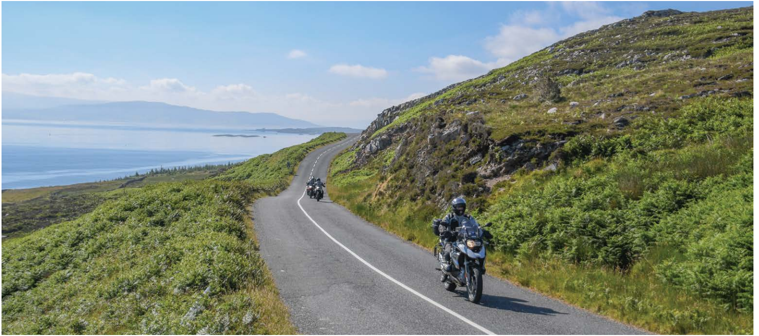
Riding the Coastline of Ireland