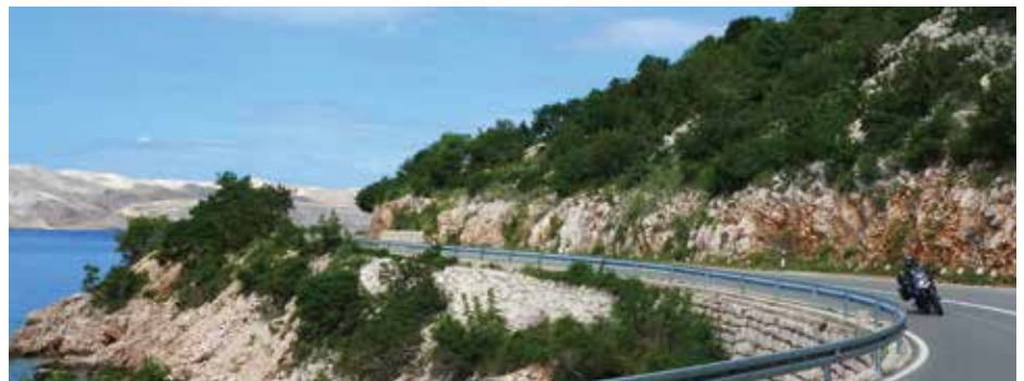
Riding the Adriatic Coastline