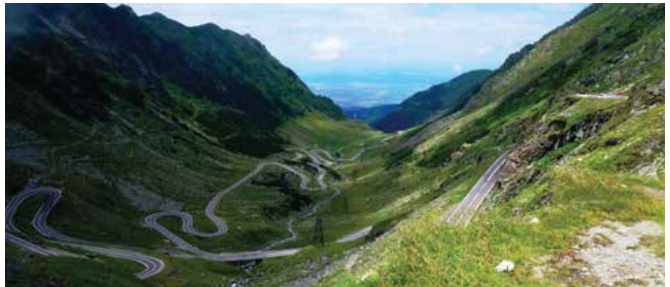
Transfagarasan Highway, Romania