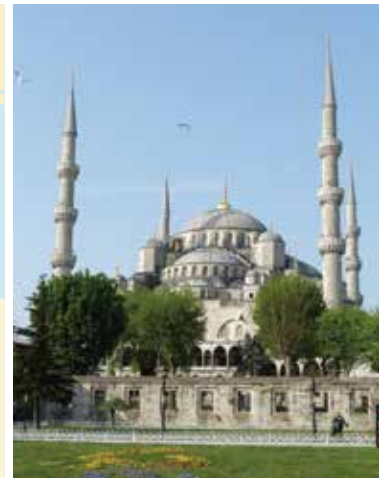
Sultan Ahmed Mosque, Istanbul