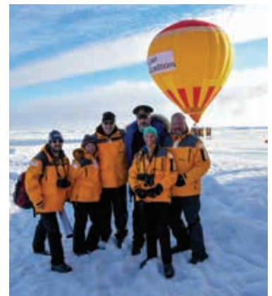
Hot Air Balloon Ride