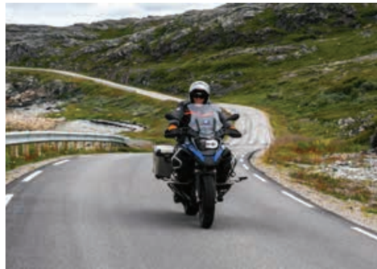
Riding in Norway