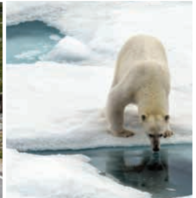
Polar Bear Spotting