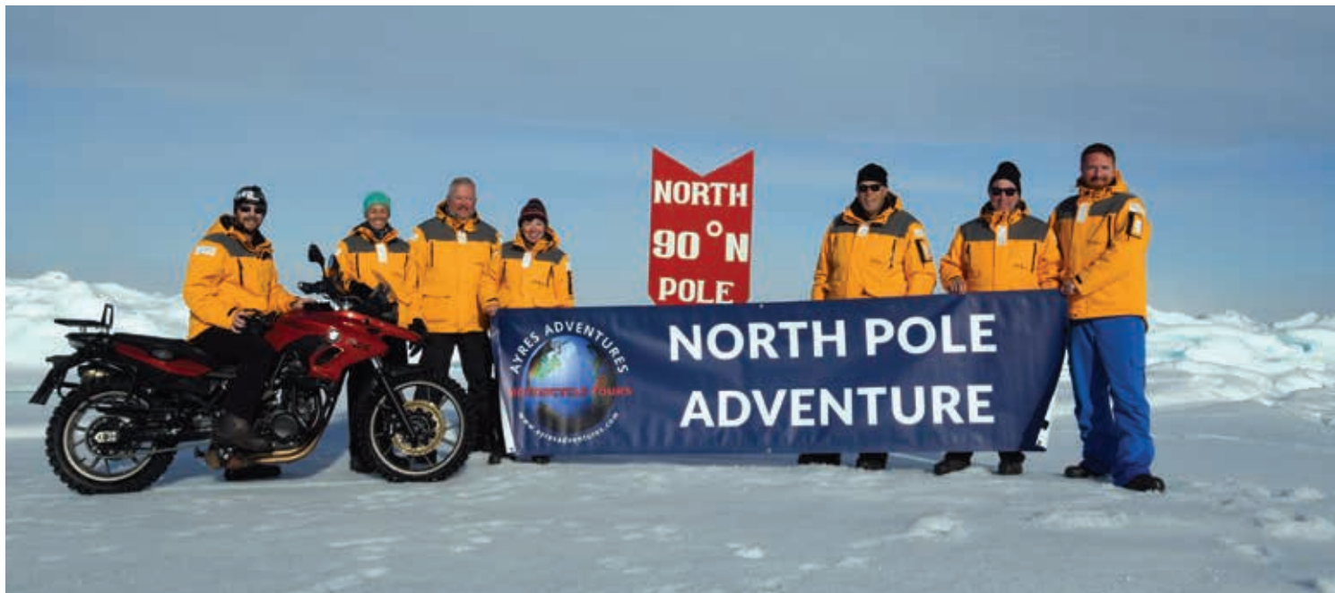
2017 North Pole Adventure Group