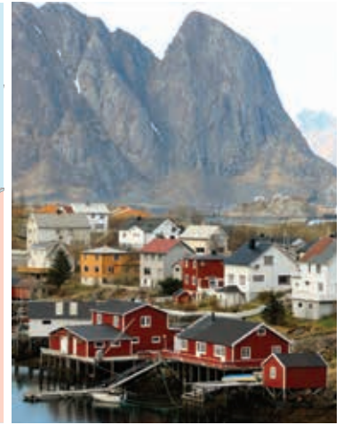
Lofoten Islands, Norway