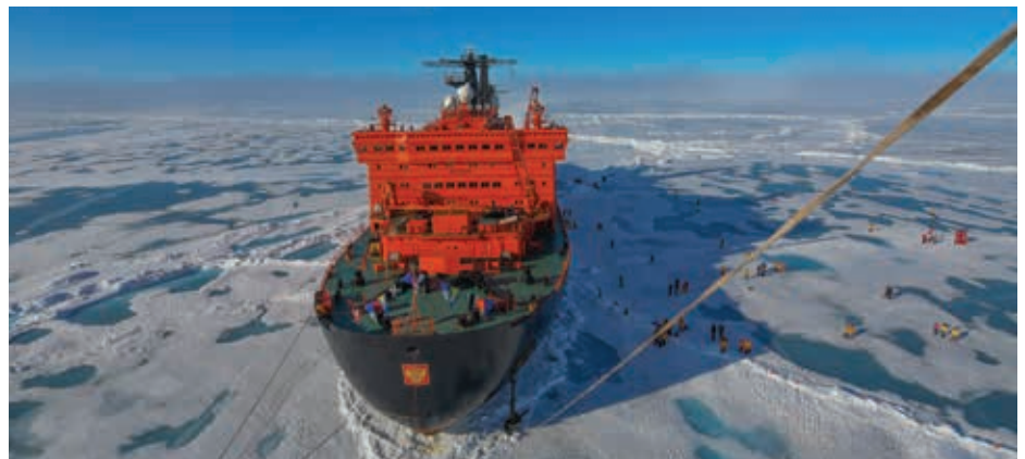
50 Years of Victory Ice Breaker