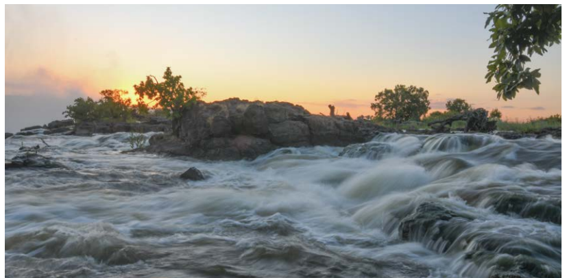
Sunset at the Top of Victoria Falls

All I wanted to do was get back to Africa. We had not left it yet, but when I would wake in the night, I would lie, listening, homesick for it already.