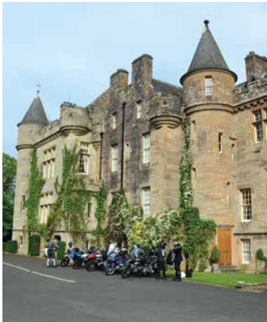
Glenapp Castle, Ballantrae

Price includes upscale accommodations, whisky distillery tasting, castle overnight stay, à la carte dining, all breakfasts, 9 dinners, airport transfers, trip booklet.