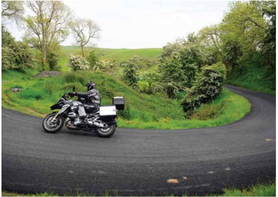
Twisty Back Roads