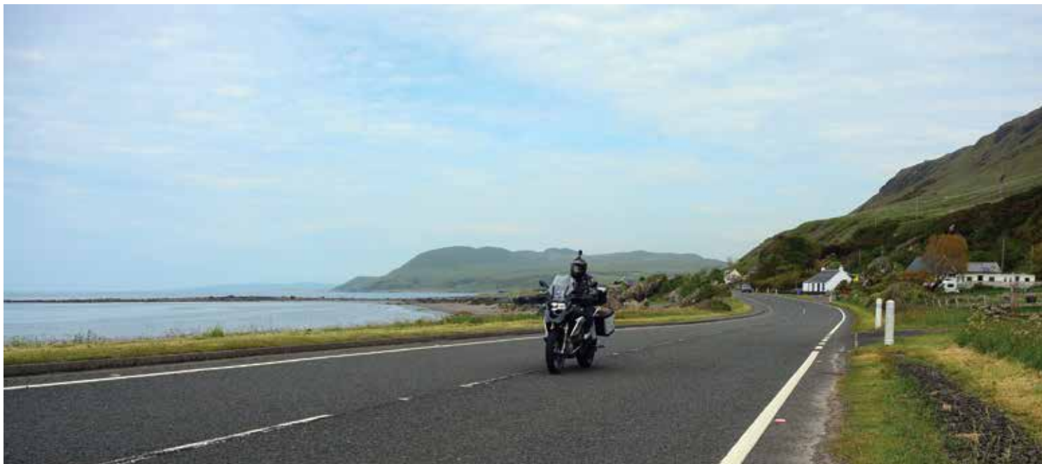
Riding the Coastline of Scotland