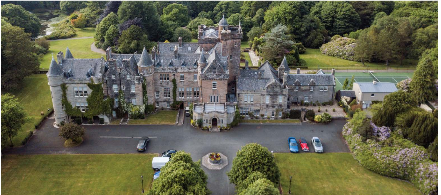
Glenapp Castle, Ballantrae