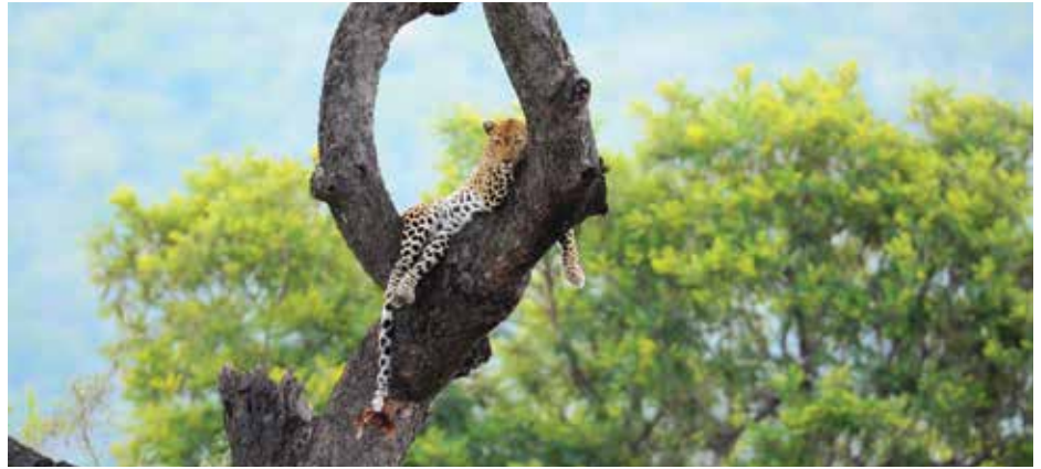
Kruger National Park, South Africa