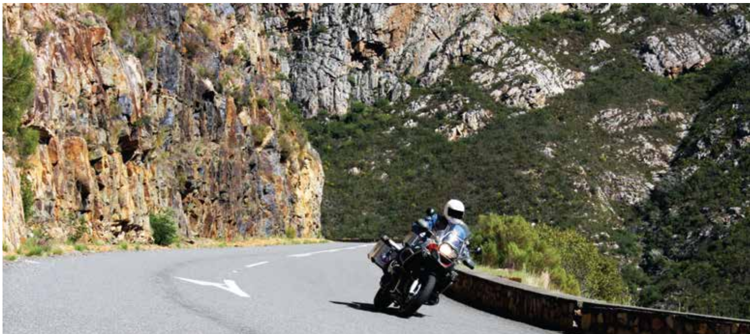
Riding the Swartberg Mountains