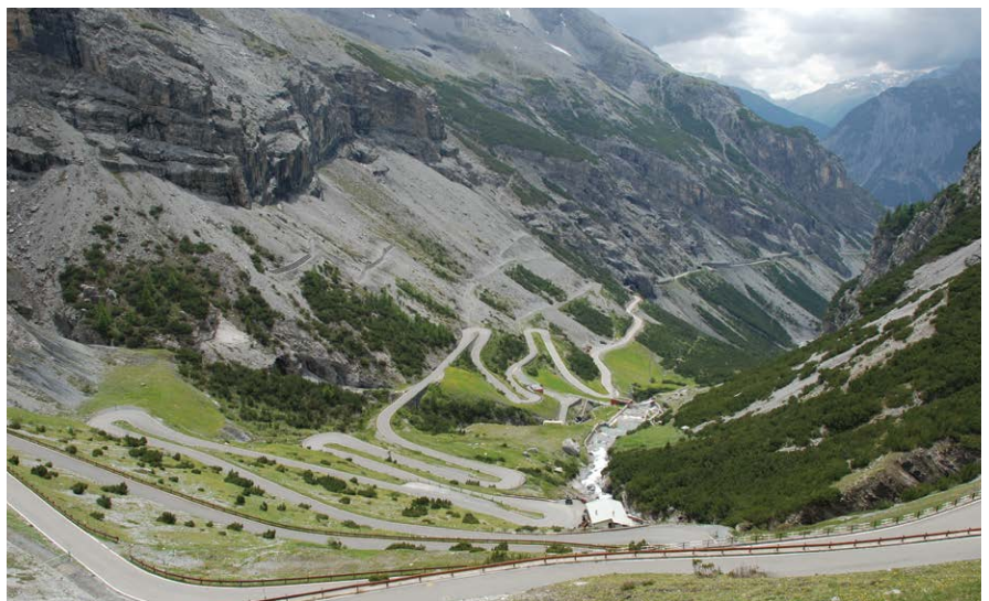
The Stelvio Pass, Italy