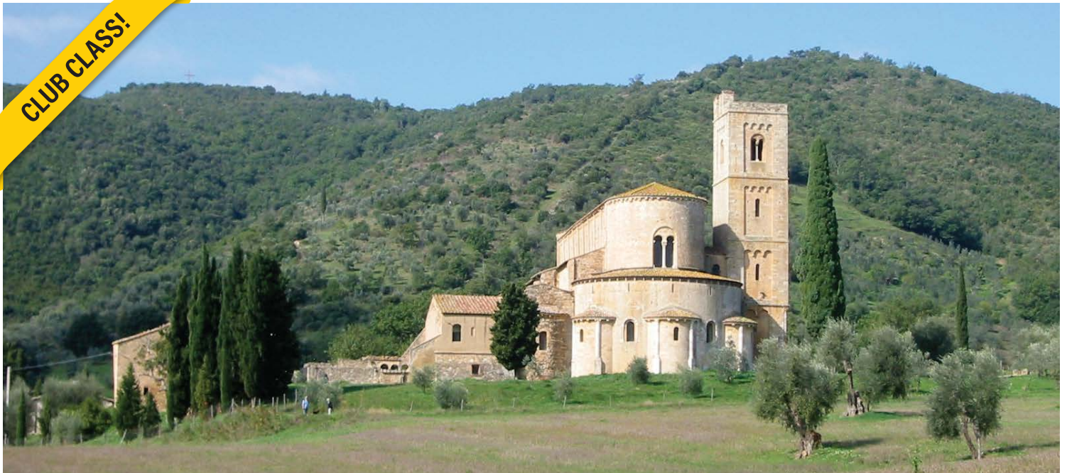
The Abbey of Sant'Antimo