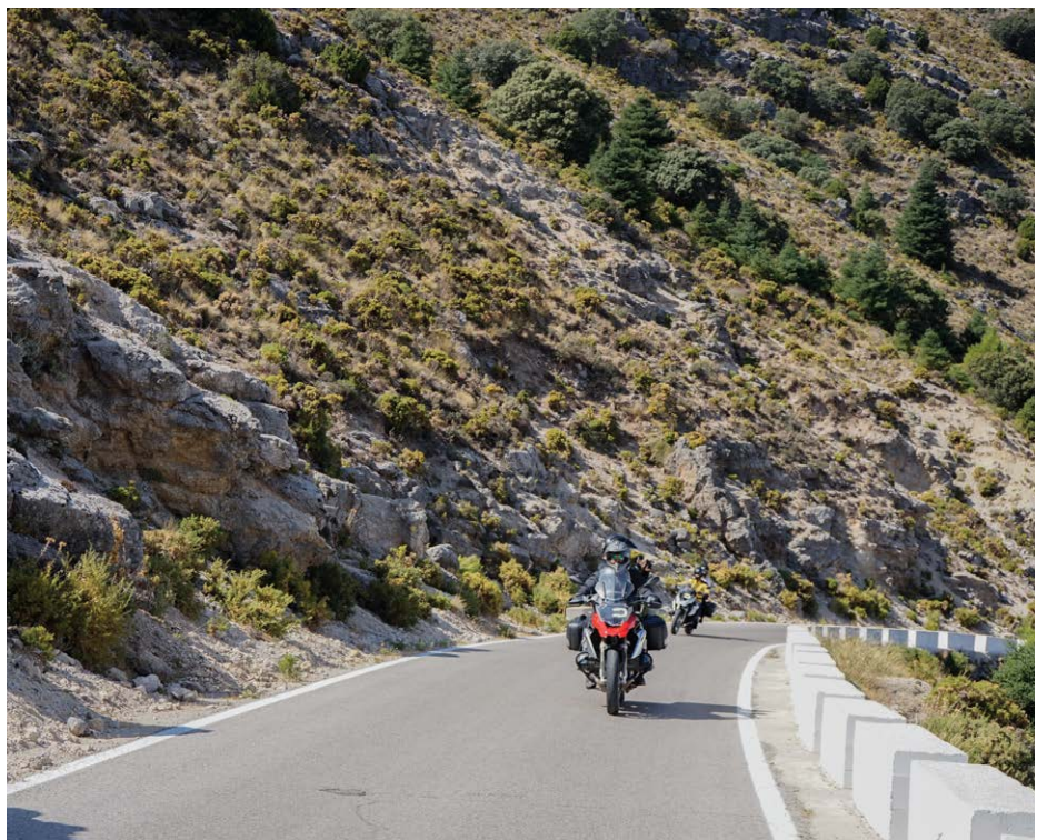
The Backroads of Spain