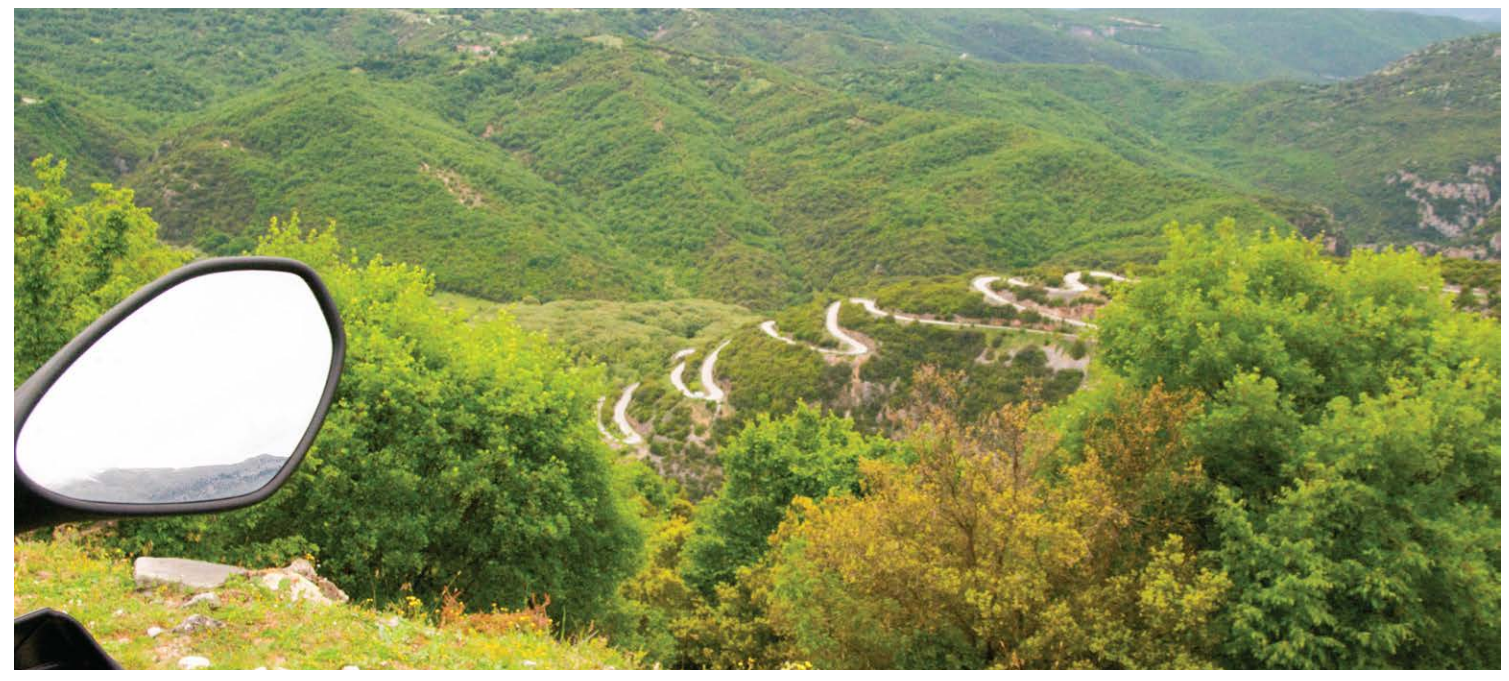
Transfagarasan Mountain Road