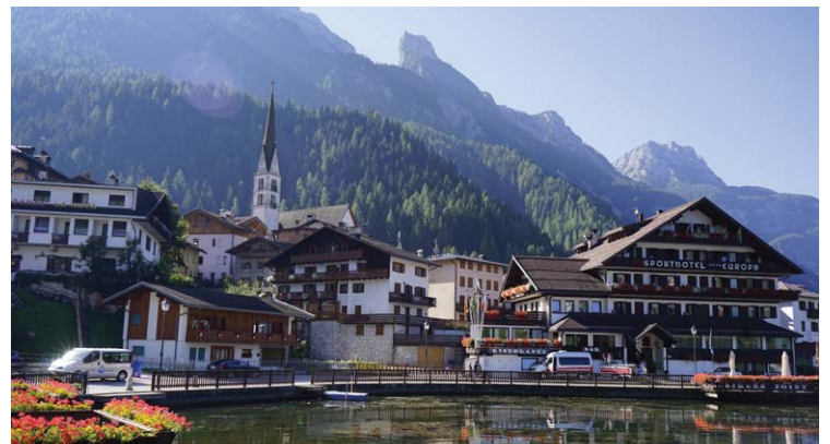
Village in Italy