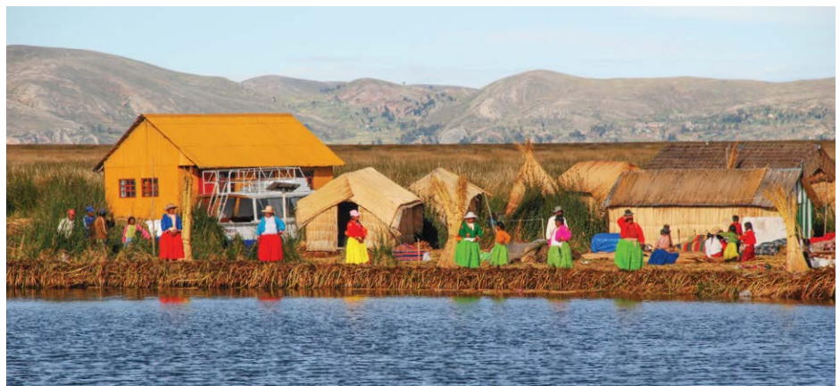
The Floating Islands of the Uros Indians, Peru

Roads are paved and mostly in good condition. Riders will spend approximately one week at altitudes between 10,000 and 14,000 feet and should be prepared for cold temperatures. Approximately 5% of the route has potholes. Dense traffic should be expected in bigger cities like Arequipa, Cusco, Juliaca and Puno. This tour is suitable for two-up riding.