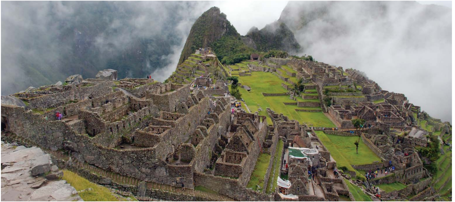
Machu Picchu, Peru