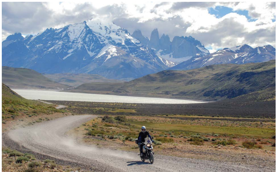
Riding in Patagonia, Chile

In addition to the standard inclusions on all of our premium tours, the tour price includes the train ride and entry to Machu Picchu, Uros visit on Lake Titicaca, the visit to Colca Canyon, entry fee to Valley of the Moon, all breakfasts and 10 dinners.