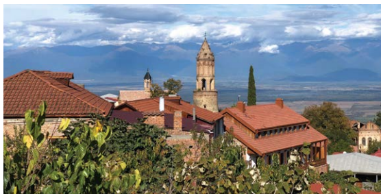
Architecture in Georgia

The route has a variety of road conditions including wonderful sweeping roads as well as some technical riding on twisty mountain roads with several hair-pin turns. There are approximately 40 miles of unpaved roads and several sections of roads with numerous potholes. Riders should be prepared for local drivers not adhering to road rules. This tour is suitable for very experienced riders.