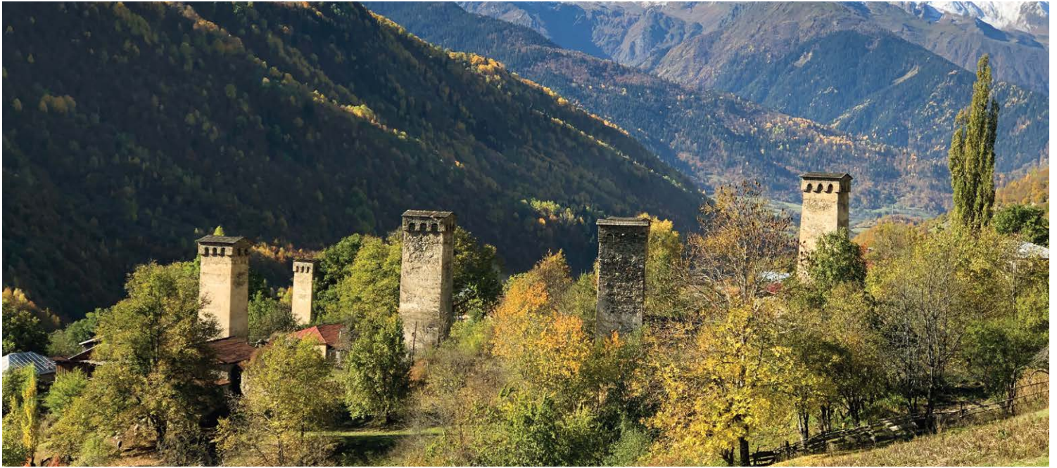
Towers of Svaneti, Georgia