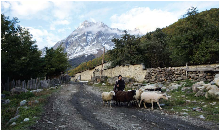
Village in Georgia