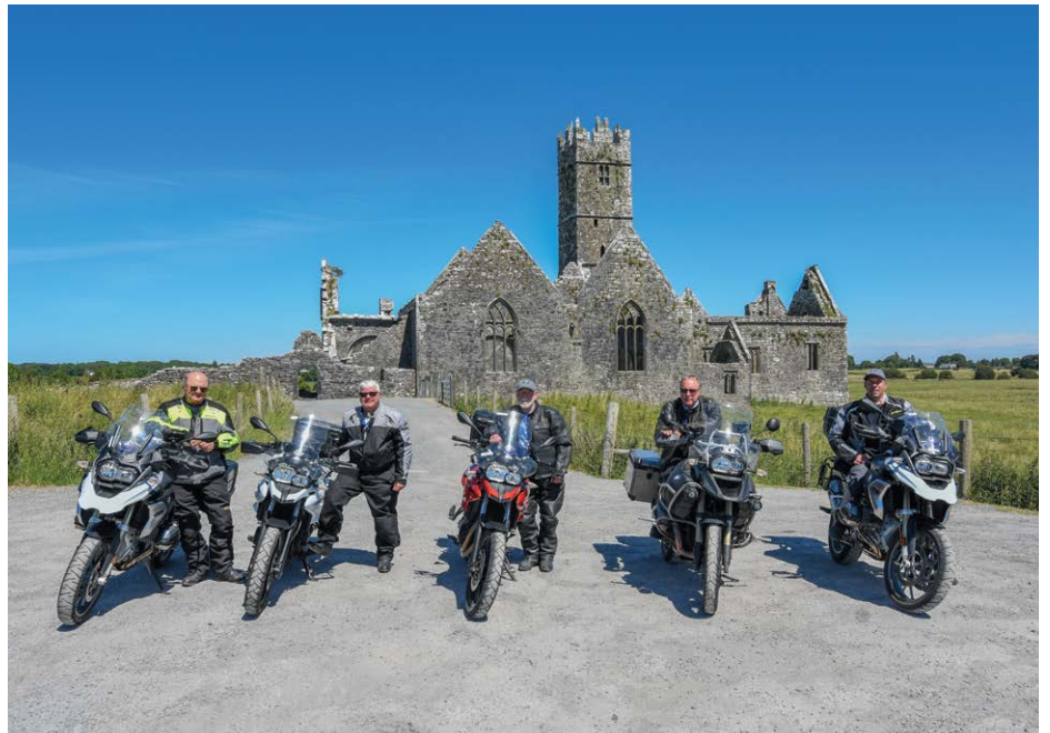
Ross Errilly Friary

In addition to the standard inclusions on all of our premium tours, the tour price includes entry fees to the Cliffs of Moher and Giant's Causeway, all breakfasts and 9 dinners.