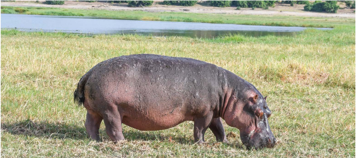
Grazing Hippopotamus, Chobe River National Park, Botswana