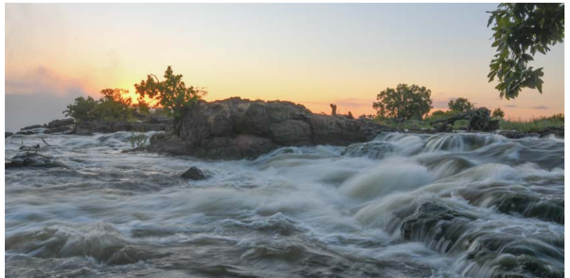
Sunset at the Top of Victoria Falls

All I wanted to do was get back to Africa. We had not left it yet, but when I would wake in the night, I would lie, listening, homesick for it already.