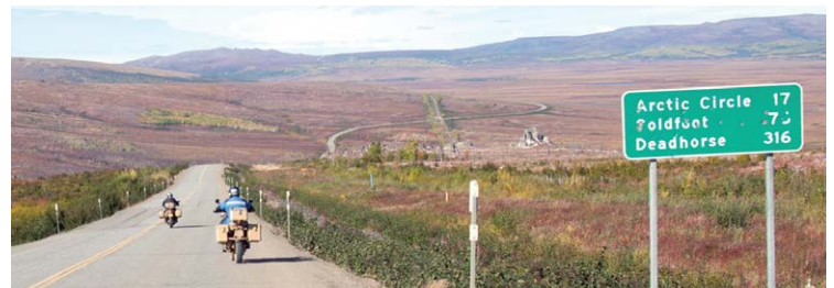
On the Way to Prudhoe Bay