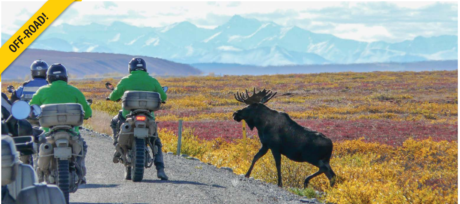
Dalton Highway, Alaska, USA