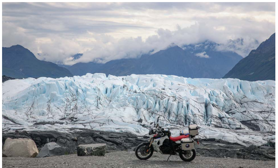
Matanuska Glacier, Alaska, USA