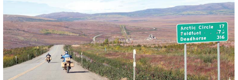
On the Way to Prudhoe Bay