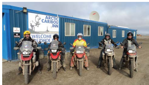
Deadhorse, Alaska, USA

CAUTION! - The Prudhoe Bay Excursion is an EXTREME Adventure and should only be undertaken by riders with experience on unpaved roads in a variety of adverse weather conditions. The trip includes riding several hundred miles on unpaved roads which are sometimes slick due to rain, sleet and occasionally snow. Prudhoe Bay riders will be responsible for increased deposits to cover potential damages to the motorcycle.