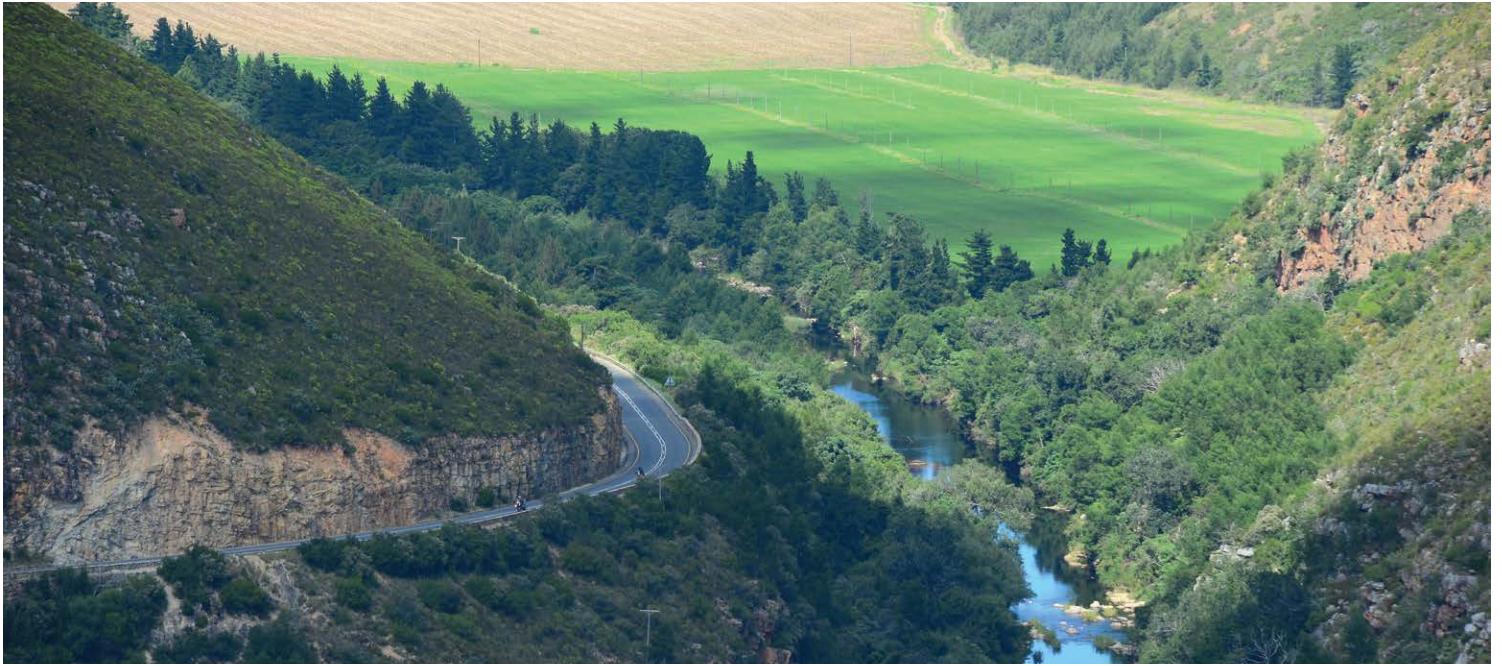
Riding the Swartberg Mountains