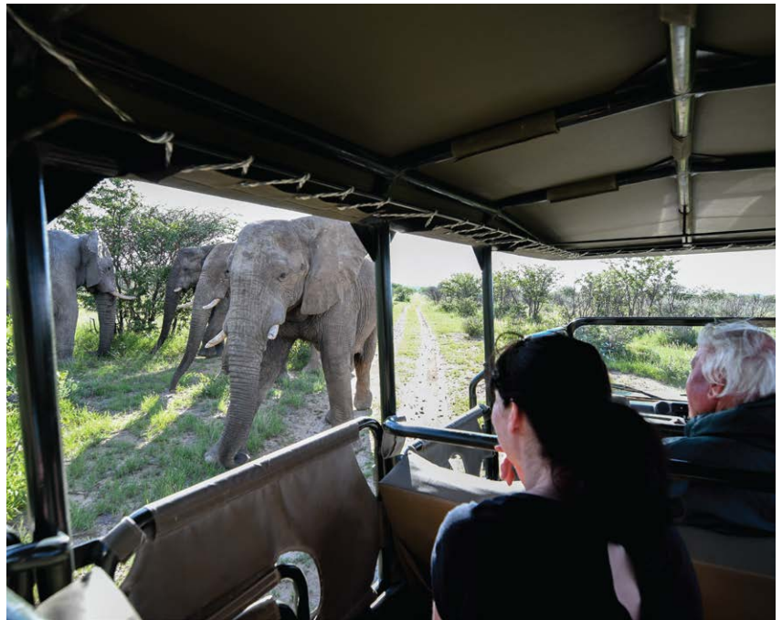
Kruger National Park

Our second tour (Southern Cross) was amazing. Another trip with top notch motorcycles, accommodations, guides, scenery and excursions... Ayres attention to detail sets them apart from other touring companies.