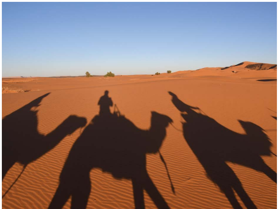
Shadows in the Sahara Desert