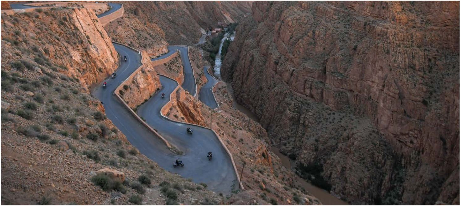
Dades Gorge, Morocco